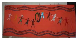
North Mackay State School