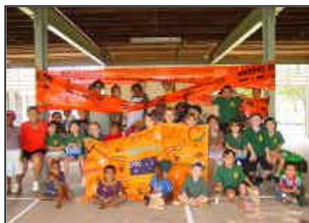
Normanton State School

For more information about the Harmony Day celebrations through Hockey around Queensland, please log onto http://rihp.hockeyqld.com.au/