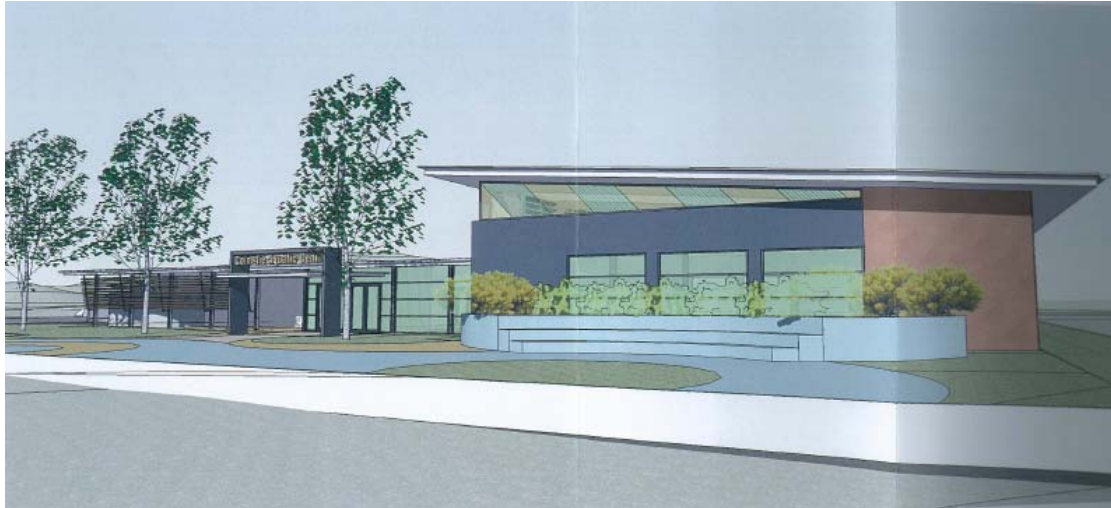
Artist's impression of entry

As you are probably aware, construction of the new $7.5m swimming pool complex at the Colmslie Recreation Reserve on Lytton Road has now begun. The complex will include a heated outdoor 50m pool and a heated indoor pool. The pool basins are largely complete with the building structures the next significant activity on site.